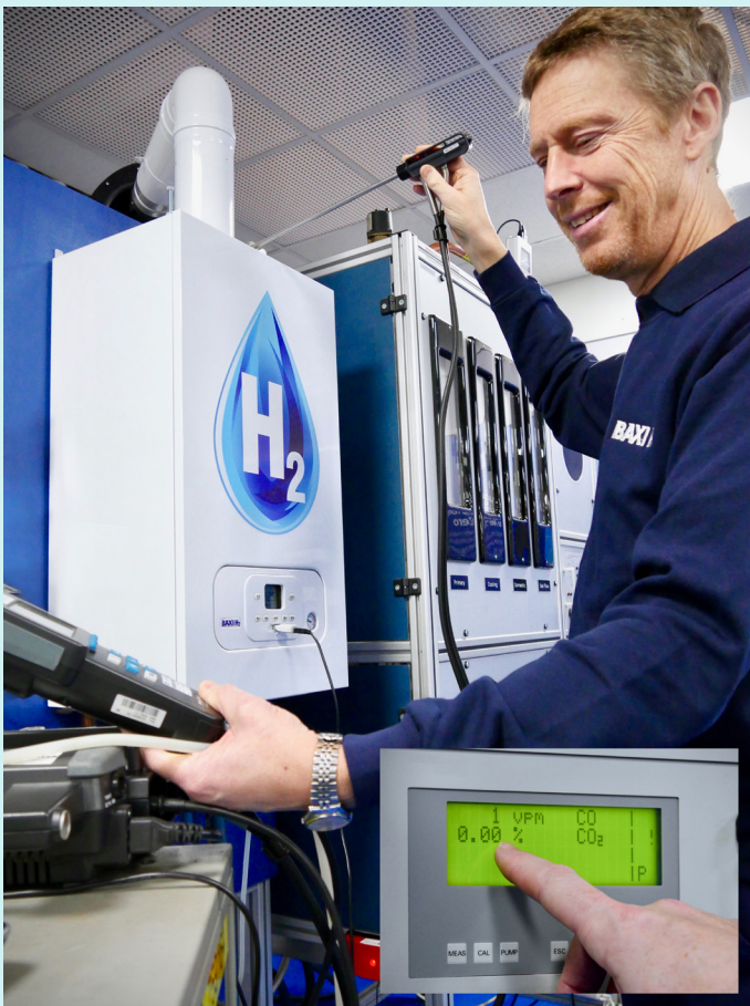
Baxi Heating Hydrogen Combination Boiler (R&D Laboratory, Preston UK)

An initial trial of an operational hydrogen boiler in a real-life situation began in Rozenburg, Netherlands, in 2019. Further refinement and development of the hydrogen boiler concept will be demonstrated in the UK through the Hy4Heat programme.